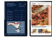
Event Reader Boards